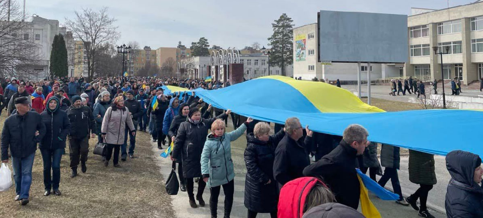
Demonstration in Slavutich with the unfurling of a large Ukrainian flag.

explained that on 9 March, the anniversary of the national poet Taras Shevchenko's birthday, they lost their fear and began to demonstrate 51 . In cities like Beryslav or Energodar, public rallies were held at monuments or other places symbolic of Ukrainian identity. In Melitopol some demonstrations were organised after the mass in the city's Orthodox church. In fact, according to the demonstrators the parish priest of the church played an important role in the protest actions against the Russian occupation 52 .