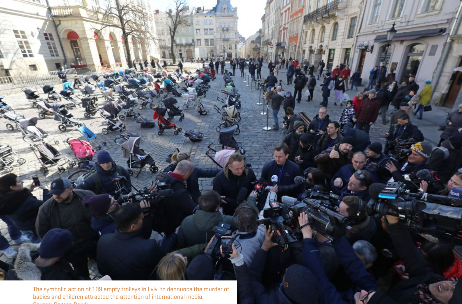
The symbolic action of 109 empty trolleys in Lviv to denounce the murder of babies and children attracted the attention of international media.