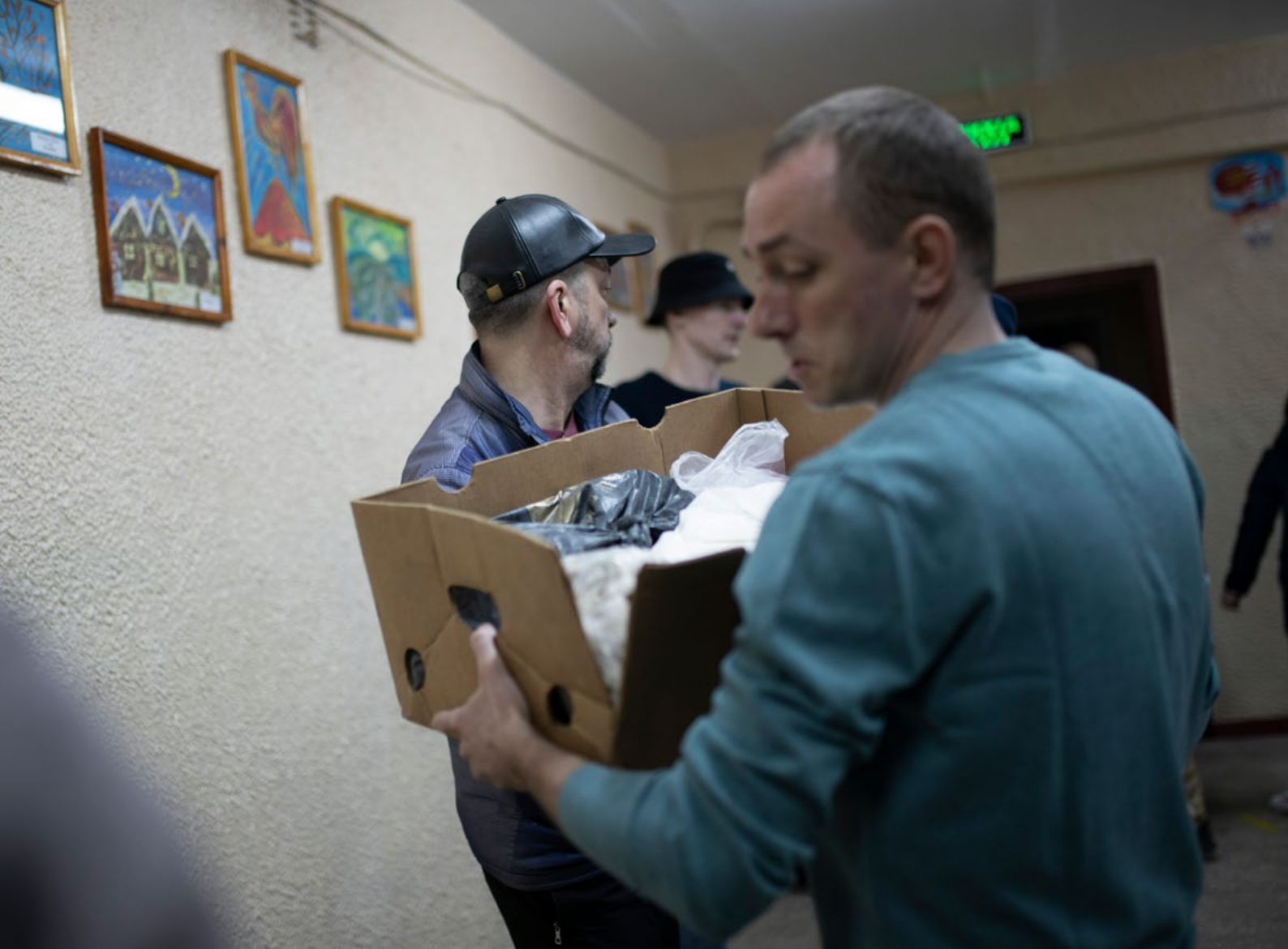
Human chain in Slavutich to unload a humanitarian aid truck in Slavutich.

petent 134 in this matter, contributing to the first indictments for war crimes 135 .